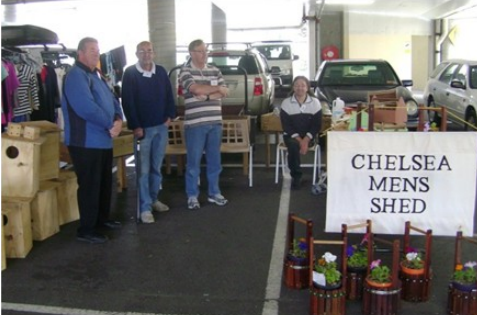
Sheddies displaying the Shed's wares