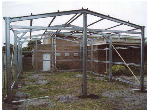
Next came the empty shed